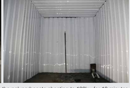
The gas burner exposes the polycarbonate sheeting to 100kw for 10 minutes, and then 300kw for a further 10 minutes until flashover is reached.