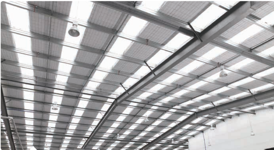
TWIN SKIN SYSTEMS