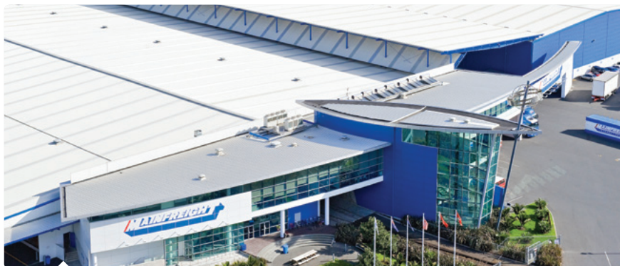
TOPGLASS® COLOUR: OPAL PROFILE: MAXISPAN® 2400 G/M 2

*Refer to the Alsynite Technical catalogue for full warranty information.