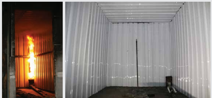
The gas burner exposes the polycarbonate sheeting to 100kw for 10 minutes, and then 300kw for a further 10 minutes until flashover is reached.